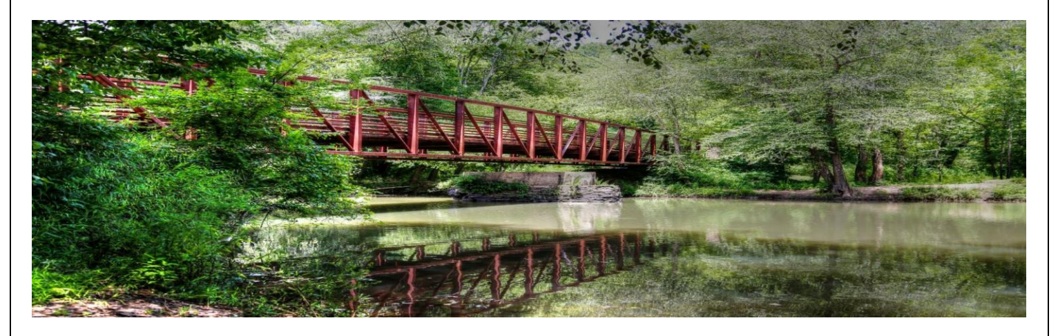
Olde Rope Mill Park

"I'm asked all of the time about what my job involves, and I answer, 'I activate play throughout the city.' What could be better than that? My goal is to facilitate the best programs, classes and experiences possible for the citizens of Woodstock with an open mind in creating new recreation possibilities all the while focusing attention on our beautiful parks and trails."