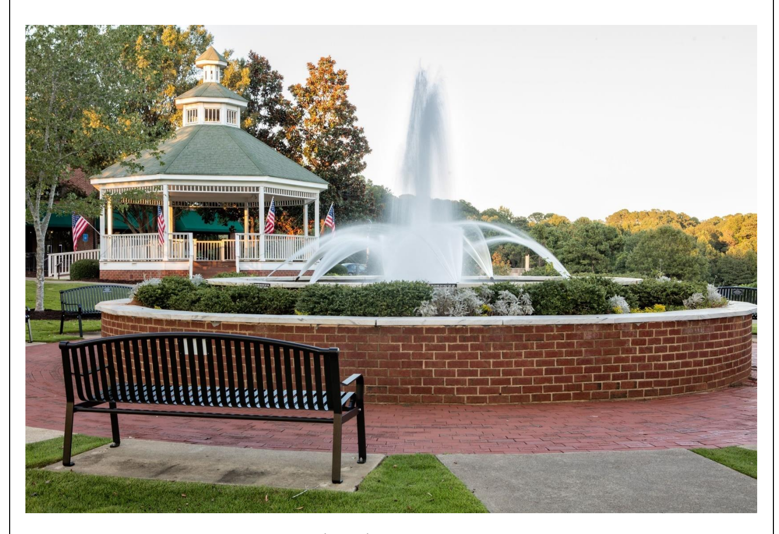
The Park at City Center