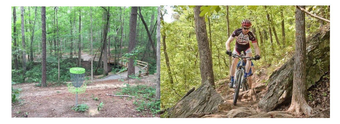
Outdoor Recreation in Woodstock

These benefits are highlighted in the adopted Greenprints Plan, adopted CAPRA (Council for Accredited Parks and Recreation Agencies) documents, and as priorities for the City of Woodstock Community Development team when approving new developments and requiring the installation of trailheads, greenspaces, and trail connections. The City of Woodstock is committed to preserving greenspace, sustainable practices, and connecting the city through trails.